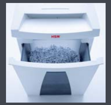
Removable container for the convenient removal of shredded material