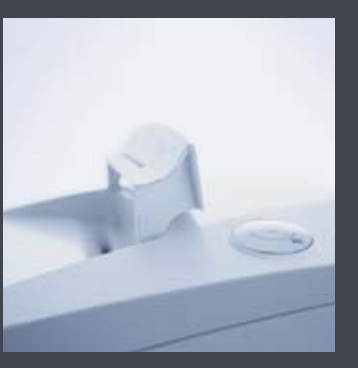
Folding safety element for ideal protection of the operator