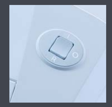
On/off switch with integrated return function