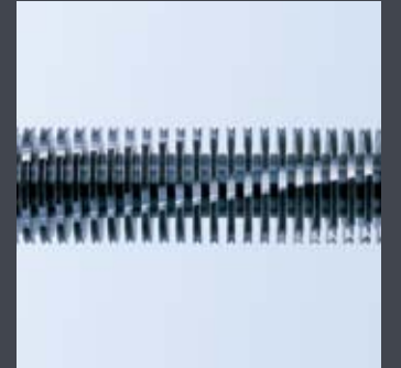
HSM lifetime warranty on the solid steel cutting rollers: the HSM warranty for the entire service life