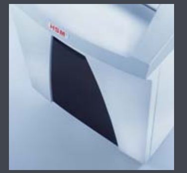
Level indicator through inspection window