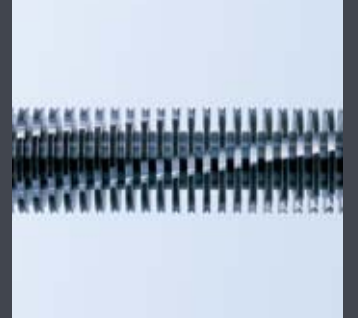
HSM lifetime warranty on the solid steel cutting rollers: the HSM warranty for the entire service life of the product.